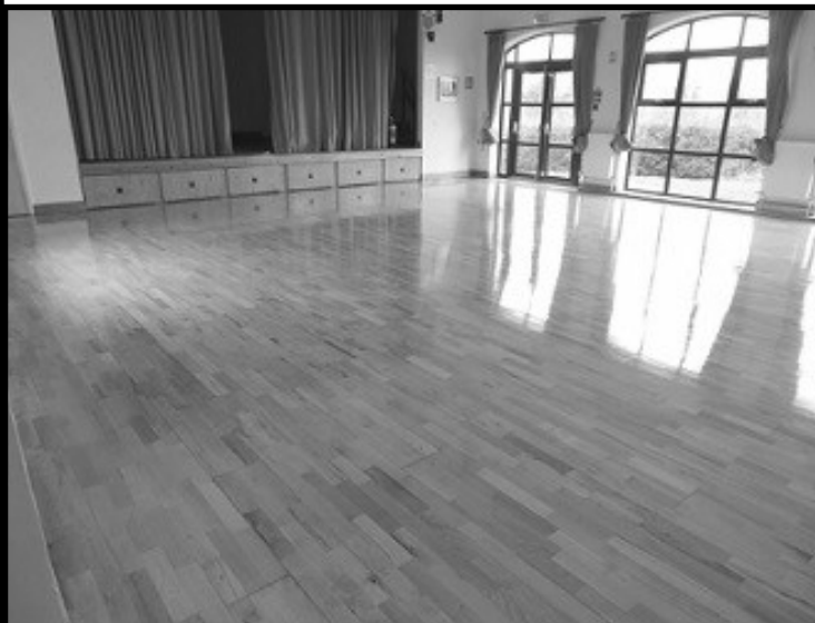
The Main Hall as it now looks...

The recent high-winds wrought no more event than the top of the water butt taking a trip across the grass! We hope you were similarly fortunate.