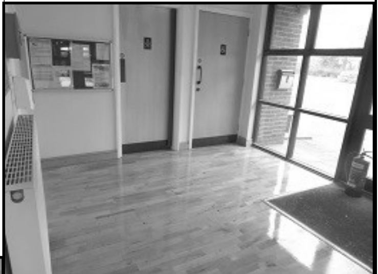
The Entrance Foyer as it now looks...

PC, Laptop and Tablet supply. Repairs and Tuition.