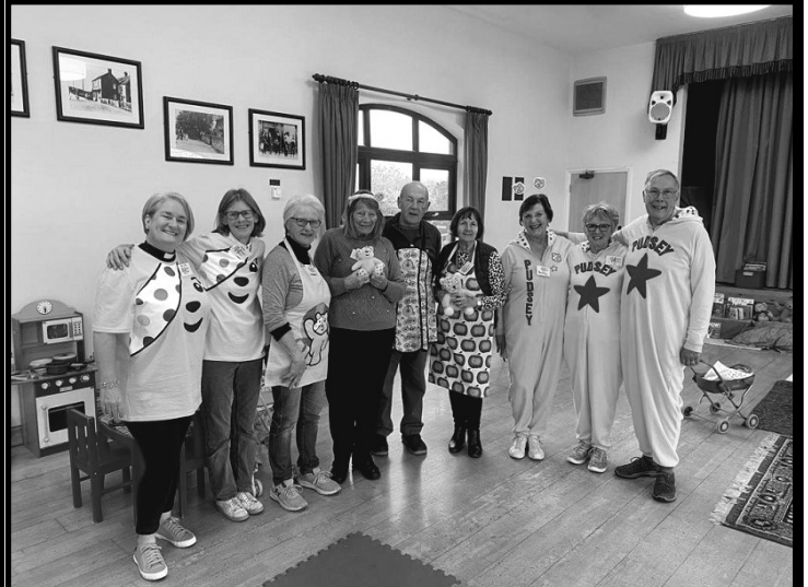
(above) 'The Hippo Team ready for the many families that came to the Pudsey Bear morning'.

It's a great way of meeting other local families.